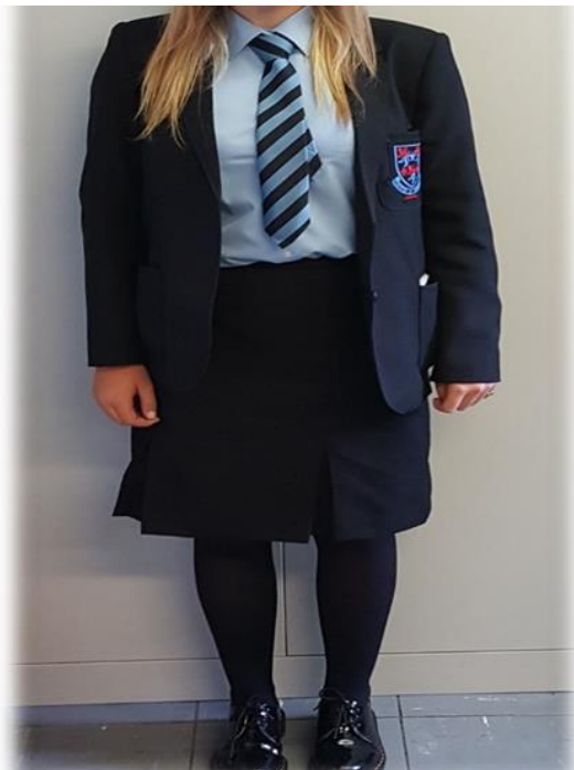
Portadown College uniform with Sixth Form tie