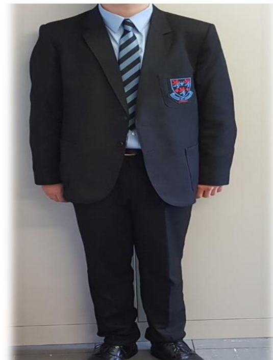
Portadown College uniform with Sixth Form tie